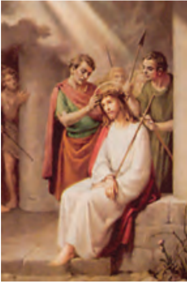
3. CROWNING WITH THORNS: And they stripped Him and put on Him a scarlet cloak; and plating a crown of thorns, they put it upon His head, and a reed in His right hand. Matthew 27, 28-29