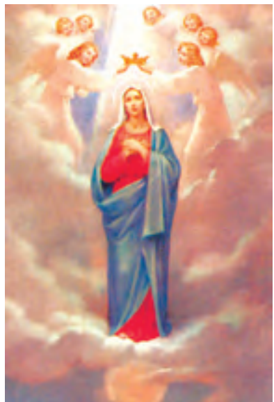
5. MARY IS CROWNED QUEEN OF HEAVEN AND EARTH: And a great sign appeared in Heaven: a woman clothed with the sun, and the moon was under Her feet, and upon Her head a crown of twelve stars. Apocalypse 12, 1