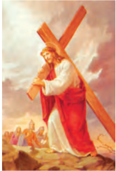
4. CARRYING OF THE CROSS: And bearing the cross for Himself, He went forth to the place called Calvary, in Hebrew, Golgotha. John 19, 17