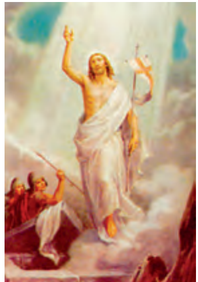
1. THE RESURRECTION: He is risen. He is not here. Behold the place where they laid him. Mark 16, 6