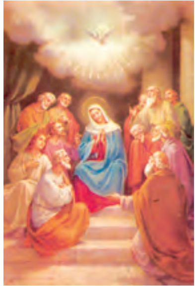
3. DESCENT OF THE HOLY GHOST: And suddenly there came a sound from Heaven, as of a mighty wind coming, and it filled the whole house where they were sitting. Acts 2, 2