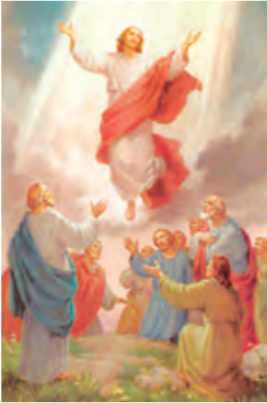
2. THE ASCENSION: So then the Lord, after He had spoken to them, was taken up into Heaven, and sits at the right hand of God. Mark 16, 19