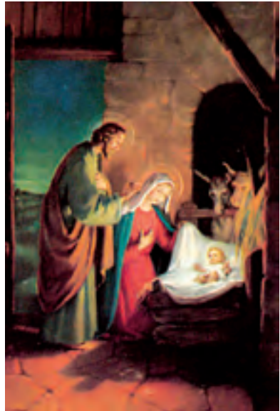
3. BIRTH OF JESUS: And She brought forth Her firstborn Son, and wrapped Him up in swaddling clothes, and laid Him in a manger, because there was no room for them in the inn. Luke 2, 7