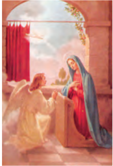
1. THE ANNUNCIATION: And when the angel had come to Her, he said, “Hail, full of grace, the Lord is with Thee, blessed art Thou among women.” Luke 1, 28

“But they will do better still and will please me even more if they say these Hail Mary’s while meditating on the Life, Death and Passion of Jesus Christ — for this meditation is the soul of this prayer.”