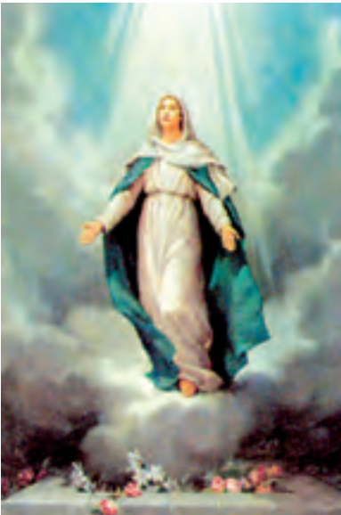
4. THE ASSUMPTION OF THE BLESSED VIRGIN: Thou art the glory of Jerusalem ... the honor of our people ... the hand of the Lord hath strengthened Thee, and therefore Thou shalt be blessed forever. Judith 15, 10-11