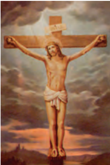
5. THE CRUCIFIXION: And Jesus cried out with a loud voice and said: "Father, into Thy hands I commend My spirit." And having said this, He expired. Luke 23, 46