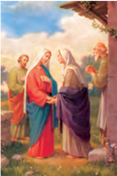
2. THE VISITATION: And Elizabeth was filled with the Holy Ghost, and cried out with a loud voice, saying, “Blessed art Thou among women and blessed is the fruit of Thy womb!” Luke 1, 41-42