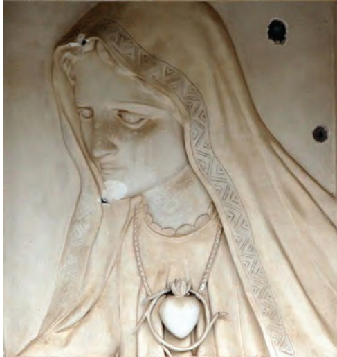
The church walls were riddled with bullet holes.

killings, and then gunmen slaughtering the hostages en masse when the Iraqi army finally stormed the church to end the five-hour siege.