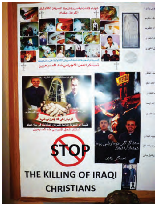
Poster features two priests martyred in the attack.

Faced with this mounting persecution of Christians, to what can we look for the an-