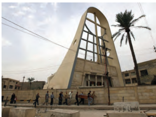
Our Lady of Salvation Church in Baghdad where the massacre took place.

then we heard a loud explosion and the terrorists entered the church – five or six in all – and started shooting everywhere.”