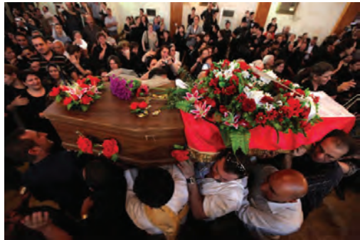
Funeral for one of the victims

This purge seems to be successful. There had been about 1.4 million Christians in Iraq, but according to a recent State Department report, there are an estimated 400,000 to 600,000 Christians who remain. More than half have fled since the 2003 US invasion of Iraq. 19