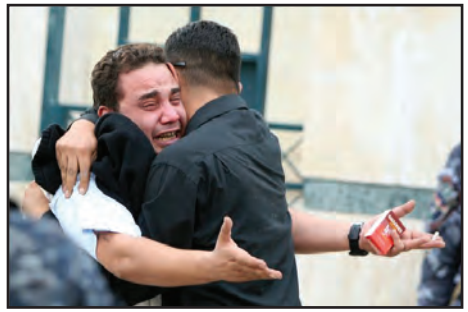
Catholic man mourns his wife murdered in the assault.