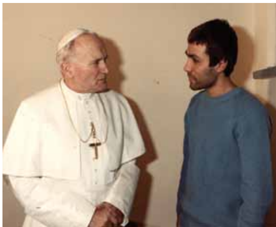
Pope John Paul II and Ali Agca