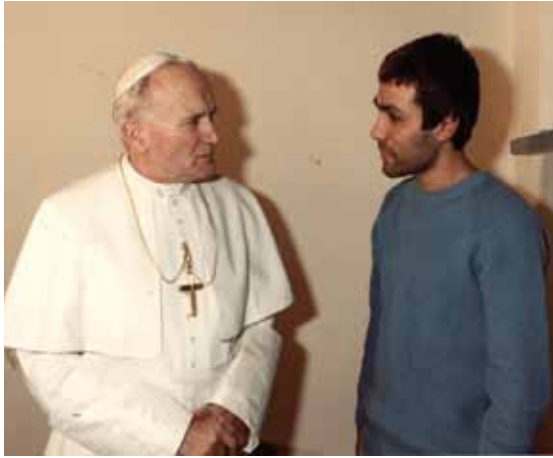
Pope John Paul II and Ali Agca