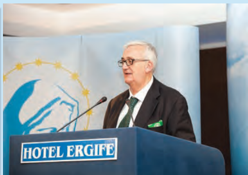
The Honorable Mario Borghezio, a Member of Parliament from Italy for the European Union, addressed the conference.