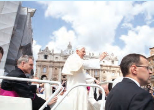
The Conference attended the Papal Audience of Pope Benedict XVI.