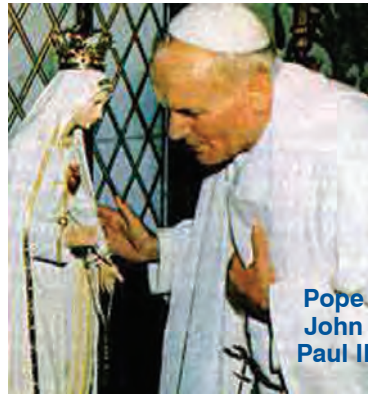
Pope John Paul II

Just last year, the current Holy Father visited Fatima again and spoke of how its prophecy is to be fulfilled at some point still in the future – thus opening the Fatima controversy wide once again, much to the consternation of the opponents of Fatima here in Rome. Like his predeces-