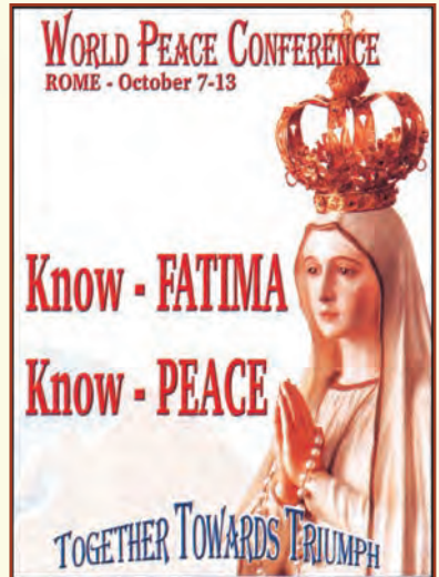
Cover of Conference Brochure