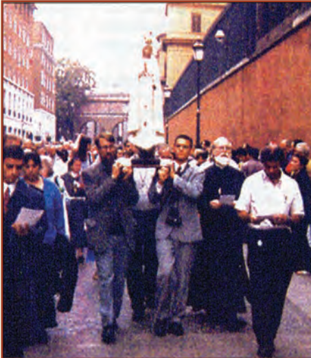
Procession from the Vatican